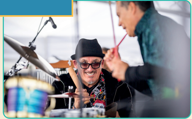
CARNAVAL

Fiesta Alameda is a celebration of Latin music, dance, culture, food and drink. Days after Oakland's famous 'Dia De Los Muertos' celebration, Fiesta brings elements of the Mexican tradition together with music, dance and visual arts from countries throughout South and Central America.