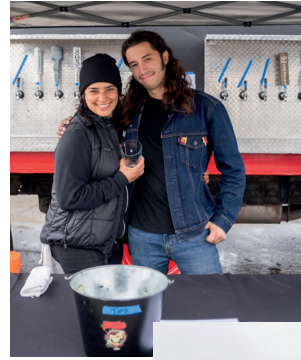
Food & Drink