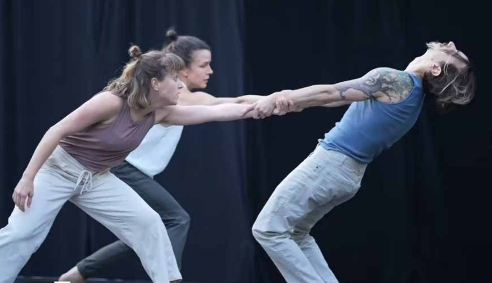
07/08 "Breathe" by Tara Pilbrow Dance, Produced as part of the Healing Garden Summer Series

"Mindblowing! It made me reassess my humanity"