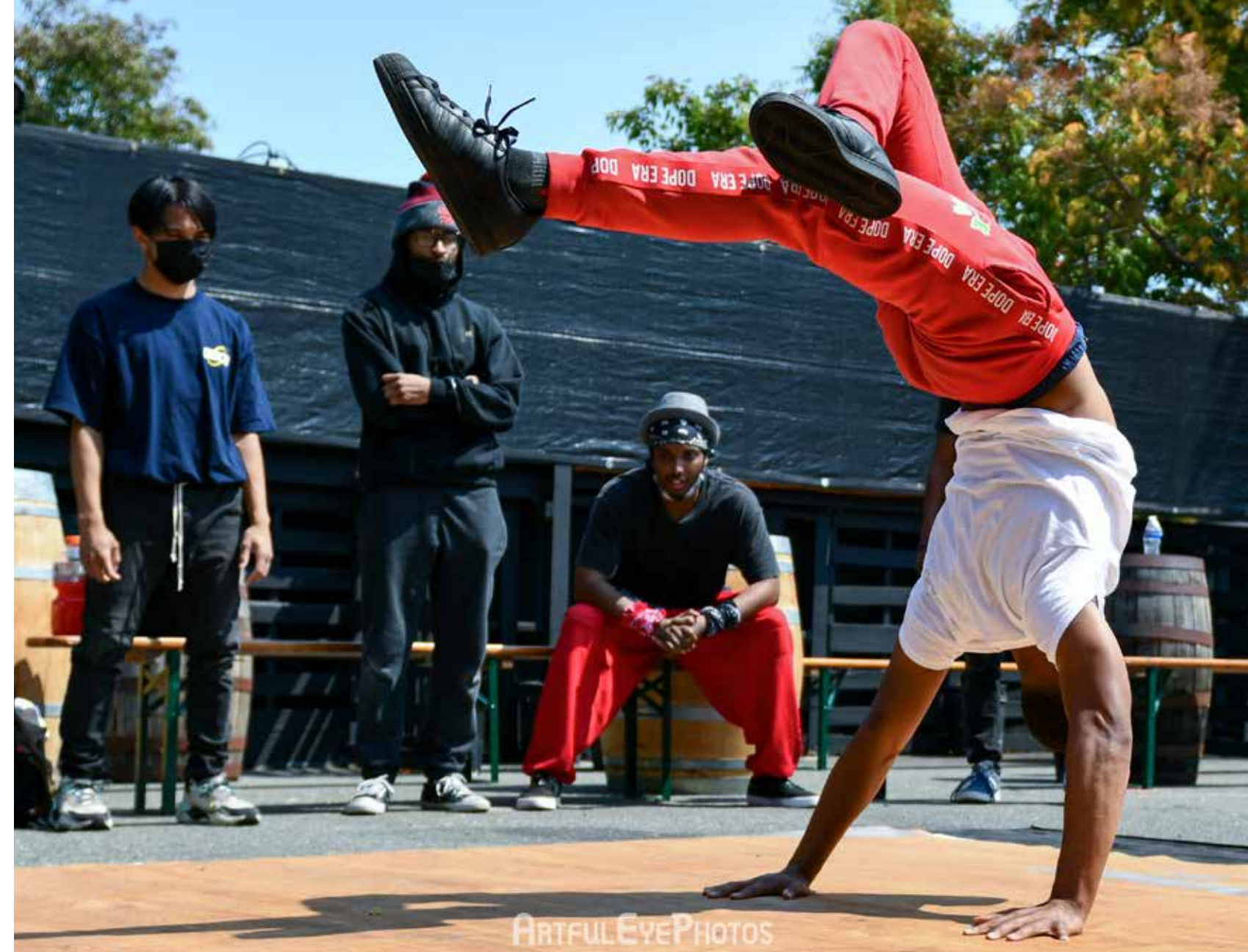
08/22 Back to School Hip Hop Fest.